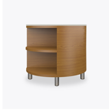
Other Table Styles

Kwalu's proprietary finish doesn't have any of the drawbacks of wood. The finish is moisture impervious, easy to clean and maintenance-free.