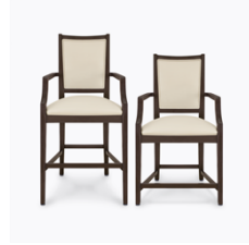
Bar and Counter Height

Cleanout prevents buildup of debris and provides for easy maintenance.