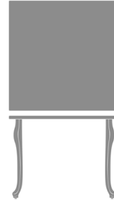
Winchester Complete Table, 42" Square, Queen Ann Legs, Bullnose 3/4", Wheelchair Height Moasdfadel: 32162 42W 42D 31.75H