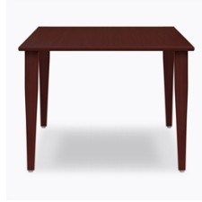
Optional Leg Style

Table height can be adjusted to accommodate wheelchairs and is optional.