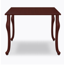
Optional Wheelchair Height

Kwalu's proprietary finish doesn't have any of the drawbacks of wood. The finish is moisture impervious, easy to clean and maintenance-free.