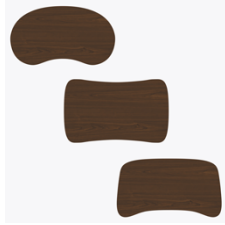
Different Top Shapes

Kwalu's proprietary finish doesn't have any of the drawbacks of wood. The finish is moisture impervious, easy to clean and maintenance-free.