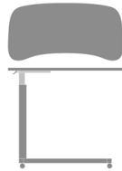
Overbed Table Spring Assist H-Base – 32"W x 16"D Kidney Top Moasdfadel: OTSA2 32W 16D 28H