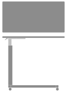
Overbed Table Spring Assist H-Base – 32"W x 16"D Rectangular Top Moasdfadel: OTSA1 32W 16D 28H