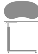
Overbed Table Spring Assist H-Base – 32"W x 16"D Jelly Bean Top Moasdfadel: OTSA4 32W 16D 28H