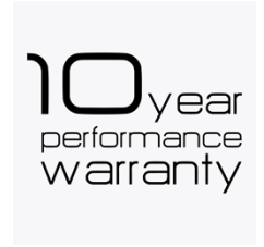
10 Year Warranty

Optional casters available on front legs only.