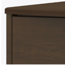
Waterfall Edging on Top

The kit and instructions for wall mounting are included with this product. The wall mount instructions provided must be followed carefully for a secure, durable, and long-lasting solution to ensure the safety of the unit and the user.