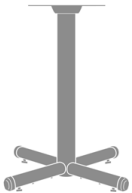
Table Base – Pedestal X Base, Small, Standard Height Moasdfadel: TBL24 20.5W 20.5D 28.5H