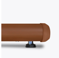
Adj. Height Glides

Kwalu's solid surface (1/8" thick) proprietary finish doesn't have any of the drawbacks of wood. The frames are moisture impervious, graffiti-resistant, easy to clean and maintenance-free.