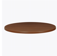
Compatible Table Tops

Wheelchair height base is available and is optional.