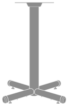
Table Base – Pedestal X Base, Small, Wheelchair Height Moasdfadel: TBL24W 20.5W 20.5D 30.5H