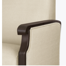
Easy to Grasp Handgrip

Our patented steel-reinforced joint system uses over 20 pieces of steel in most Kwalu chairs. Stop ongoing and costly furniture replacement.