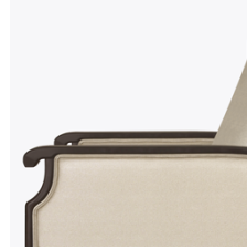
Push on the Arms Mechanism

Extended arm creates easy to grasp handgrip.