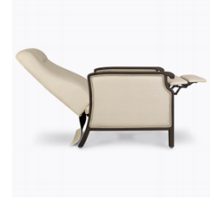
Three Position Recliner

Concealed cleanout eliminates a debris build-up behind the seat cushion.