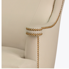
Easy to Grasp Handgrip

Kwalu's solid surface (1/8" thick) proprietary finish doesn't have any of the drawbacks of wood. The frames are moisture impervious, graffiti-resistant, easy to clean and maintenance-free.