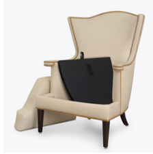
Removable Seat Deck

Extended arm creates easy to grasp handgrip.