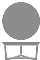
Talana Coffee Table, with Apron, Round Top Moasfadel: TATTBLB1R 38W 38D 18H