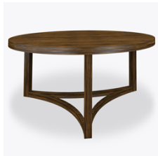
Optional With No Apron

Kwalu's proprietary finish doesn't have any of the drawbacks of wood. The finish is moisture impervious, easy to clean and maintenance-free.