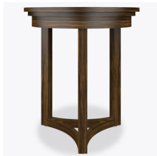
Other Table Styles

Tops for this table with an apron are standard; to get the top without an apron is optional.