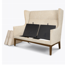
Removable Seat Deck

Our patented steel-reinforced joint system uses over 20 pieces of steel in most Kwalu chairs. Stop ongoing and costly furniture replacement.