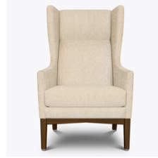
Number of Seats

Removable seat deck prevents buildup of debris and provides for easy maintenance.