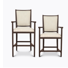
Bar and Counter Height