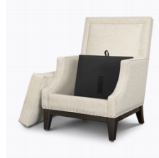
Removable Seat Deck

Choose from 2 seat styles – lounge chair and love seat.