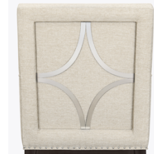
Optional Back Insert

Removable seat deck prevents buildup of debris and provides for easy maintenance.