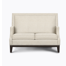
Number of Seats

Our patented steel-reinforced joint system uses over 20 pieces of steel in most Kwalu chairs. Stop ongoing and costly furniture replacement.