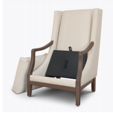
Removable Seat Deck

Our patented steel-reinforced joint system uses over 20 pieces of steel in most Kwalu chairs. Stop ongoing and costly furniture replacement.