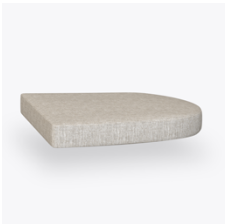
Seat Cushion is Field Replaceable

An optional visible cleanout is available to prevent buildup of debris and provide for easy maintenance.