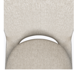
Optional Visible Cleanout

Concealed cleanout eliminates a debris build-up behind the seat cushion.