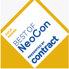
Best of NeoCon Gold

Kwalu's Prizzi Lounge wins gold in prestigious Best of NeoCon Awards competition.