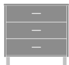
Atlanta II Chest Wide, 3 Drawers Moasfadel: A2CH30W 31.75W 18.5D 30H