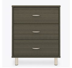
Optional Narrower Version

Raised on rust proof aluminum feet to allow ease of cleaning beneath casegood.