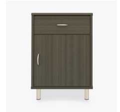
Other Bedside Styles

A top drawer lock is available and is optional.