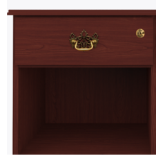
Optional Top Drawer Lock

Choose from dozens of hardware styles, including ADA compliant options.