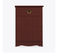
Other Bedside Styles

Top drawer lock is available and is optional; placed right if hardware is too large for center placement.