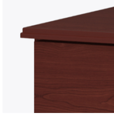
OG Edging on Top

Kwalu's proprietary finish doesn't have any of the drawbacks of wood. The finish is moisture impervious, easy to clean and maintenance-free.