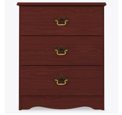
Other Chest Styles

Choose from dozens of hardware styles, including ADA compliant options.