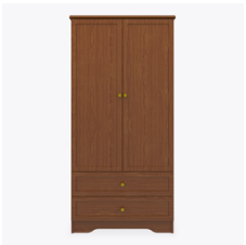
Other Wardrobe Styles

Standard clothing rod may be attached at ADA height of 48" from the floor.