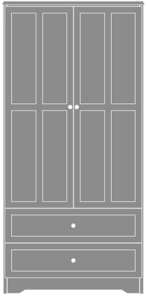
Mission Double Wardrobe, 2 Drawers, 2 Doors Moasfadel: MIWR22 34.5W 23.75D 71H