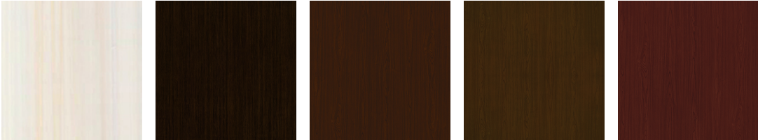
Wood Ash (Fusion)