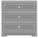
Mission Chest Wide, 3 Drawers Moasfadel: MICH30W 31.5W 19D 30H