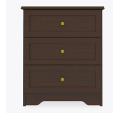
Optional Narrower Version

Are constructed with both dowel and mechanical fasteners for additional strength. 100lb static and dynamic load Euro Drawer Slides allow for easy opening and closing.