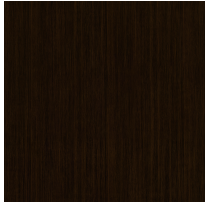
Midnight Oak (Fusion)