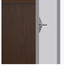
Wall Mount Hardware

Kwalu's proprietary finish doesn't have any of the drawbacks of wood. The finish is moisture impervious, easy to clean and maintenance-free.