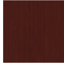
African Mahogany (Fusion)