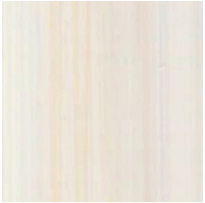
Wood Ash (Fusion)