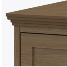
Reverse OG Edging on Top

Kwalu's proprietary finish doesn't have any of the drawbacks of wood. The finish is moisture impervious, easy to clean and maintenance-free.