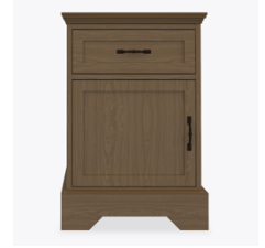
Other Bedside Styles

A top drawer lock is available and is optional.