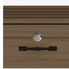
Optional Top Drawer Lock

Choose from dozens of hardware styles, including ADA compliant options.