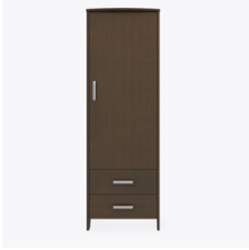
Other Wardrobe Styles

Choose from dozens of hardware styles, including ADA compliant options.