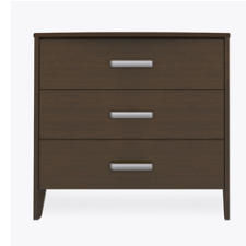
Optional Wider Version

Are constructed with both dowel and mechanical fasteners for additional strength. 100lb static and dynamic load Euro Drawer Slides allow for easy opening and closing.