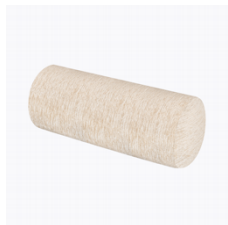
Optional without Piping

The pillow is available without piping and is optional.