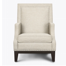
Number of Seats

Our patented steel-reinforced joint system uses over 20 pieces of steel in most Kwalu chairs. Stop ongoing and costly furniture replacement.