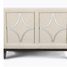
Optional Back Insert

Removable seat deck prevents buildup of debris and provides for easy maintenance.