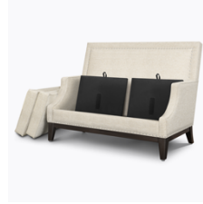
Removable Seat Deck

Choose from 2 seat styles – lounge chair and love seat.