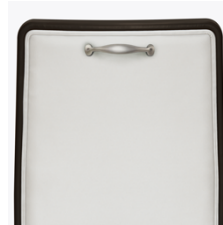
Optional Back Handle

Optional casters available on front legs only.