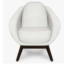
Number of Seats

Concealed cleanout eliminates a debris build-up behind the seat cushion.