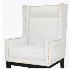
Optional Nail Head Trim

Removable seat deck prevents buildup of debris and provides for easy maintenance.