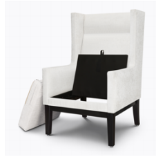
Removable Seat Deck

Our patented steel-reinforced joint system uses over 20 pieces of steel in most Kwalu chairs. Stop ongoing and costly furniture replacement.