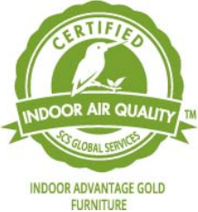
INDOOR ADVANTAGE GOLD FURNITURE