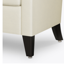
Optional without Piping

Removable seat cushion prevents buildup of debris and provides for easy maintenance.