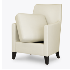
Removable Seat Cushion

Concealed cleanout eliminates a debris build-up behind the seat cushion.