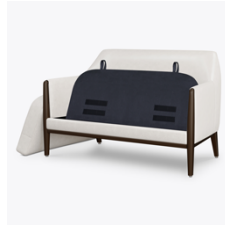
Removable Seat Deck

Our patented steel-reinforced joint system uses over 20 pieces of steel in most Kwalu chairs. Stop ongoing and costly furniture replacement.