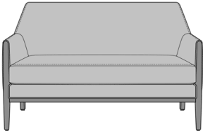
Bolsena Love Seat, with Piping Model: BSNA211LS 54.5W 29.75D 34H 25AH