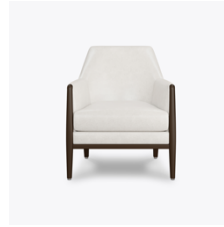
Number of Seats

Removable seat deck prevents buildup of debris and provides for easy maintenance.