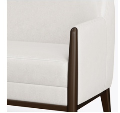
Optional Seat Construction

Available with piping around the base and arms. Not available for units with Non-Removable Seat Cushion.