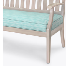
Optional Piping on Seat

Kwalu's quick drying cushion construction moves moisture through fast allowing cushions and pillows to dry rapidly.