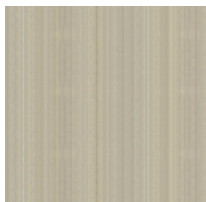
Outdoor Weathered Teak UV (Outdoor)