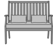
Arezzo Bench, Seat Cushion & Throw Pillows with Piping Moasdfadel: AREB1P 47W 24.5D 40H 26AH