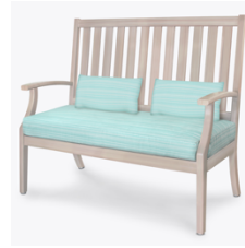
Optional Throw Pillows

Piping is available on seat and is optional.