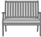
Arezzo Bench, Seat Cushion with Piping Moasdfadel: AREB0P 47W 24.5D 40H 26AH