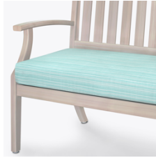
Quick Dry Cushion

Our patented steel-reinforced joint system uses over 20 pieces of steel in most Kwalu chairs. Stop ongoing and costly furniture replacement.