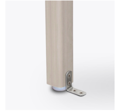
Optional Floor Mounting

Also available with a pair of throw pillows. The seat depth will be shorter if this option is selected.