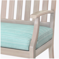
Waterproof Outdoor UV Protected Frame

Special additive protects frame against the elements and damaging ultraviolet rays.