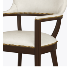
Optional Nail Head Trim

Optional casters available on front legs only.