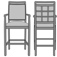
Bellariva Bar Stool, Modern Arm, Showframe with Handgrip, with Lattice Moasdfadel: BLS214B 23W 23D 47.5H 35.5AH