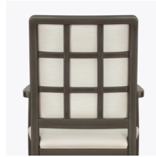
Optional Decorative Back

Cleanout prevents buildup of debris and provides for easy maintenance.