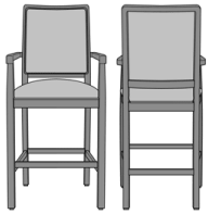
Bellariva Bar Stool, Modern Arm, Showframe, without Lattice Moasdfadel: BLS212A 23W 23D 47.5H 35.5AH