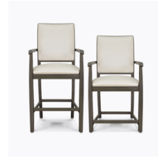
Bar and Counter Height