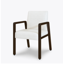
Optional Flex Short Back

Frame enables a modest amount of flexibility in the back only; seat, arms and legs remain stationary.