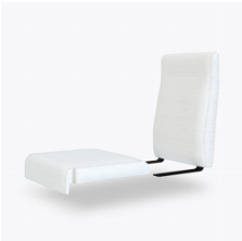
Back Cushion and Seat Cushion are Field Replaceable

Cleanout prevents buildup of debris and provides for easy maintenance.