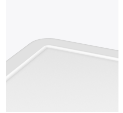
Optional Solid Surface Spill-Proof Edge

Designed with an adjustable shelf for additional storage.