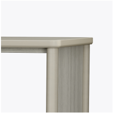
Optional Kwalu Top

The spill resistant, slightly raised edge of this solid surface top keeps minor spills in place on the top.