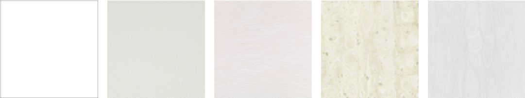
Snow White (SolidTops)