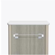
Optional Accessory Rail System

Available with a top made of Kwalu's proprietary material. Spill proof capability not available with Kwalu Tops.