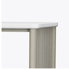
Corian®/ Hanex®/Krion® top

Protea™ Fusion doesn't have any of the drawbacks of wood. The finish is moisture impervious, easy to clean, and maintenance-free.