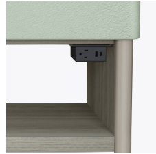
Optional Under Mount Power Module

The Ethan Wardrobe with bench has several styles to choose from. No drawer, 1 door, a 1 drawer no door version or a no drawer no door version.