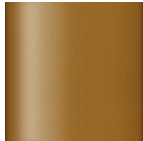
Premium Pure Copper (Classic)