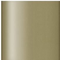
Premium Soft Gold (Classic)