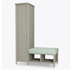
Other Wardrobe Bench Styles

These optional contrasting premium finishes are available for the Ethan Collection legs – Platinum, Soft Gold, Pure Copper and Black.