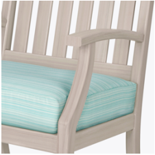
Waterproof Outdoor UV Protected Frame

Special additive protects frame against the elements and damaging ultraviolet rays.