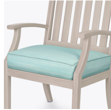
Optional Piping on Seat

Kwalu's quick drying cushion construction moves moisture through fast allowing cushions and pillows to dry rapidly.