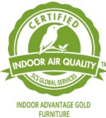
INDOOR ADVANTAGE GOLD FURNITURE