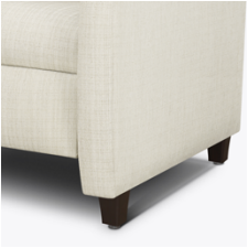
Optional Kwalu Legs

Heavy duty locking casters on rear and front non-locking casters are standard.