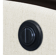
2 Button Control

The motorized recliner fully extends to a depth of 66 inches.