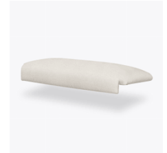
Seat Cushion is Field Replaceable

Cleanout prevents buildup of debris and provides for easy maintenance.