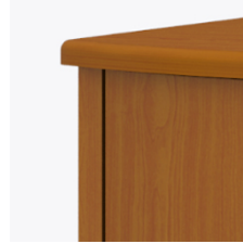
Waterfall Edging on Top

The graceful curved front is a signature Camelot feature.