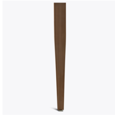
Optional Wheelchair Height

Kwalu's solid surface (1/8" thick) proprietary finish doesn't have any of the drawbacks of wood. The frames are moisture impervious, graffiti-resistant, easy to clean and maintenance-free.