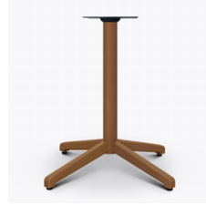
Compatible Table Bases

Choose from a number of edging options including OG, Beveled, Bullnose, Waterfall and Elliptical.