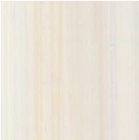
Wood Ash (Fusion)