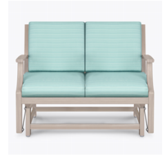
Number of Seats

Piping available on back pillows and seat cushions and is optional.