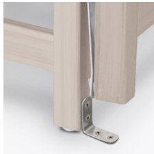
Optional Floor Mounting

Please contact a sales associate to purchase additional or replacement cushions.