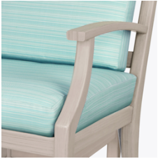
Waterproof Outdoor UV Protected Frame

Special additive protects frame against the elements and damaging ultraviolet rays.