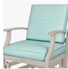
Optional Piping on Back Pillow and Seat

Kwalu's quick drying cushion construction moves moisture through fast allowing cushions and pillows to dry rapidly.