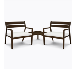
Optional Linking Tables

The seat cushion can be replaced in the field.