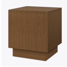
Optional Kwalu Top

Corian®/ Hanex®/ Krion® tops, .5" waterfall edged, are available only on the end tables of the collection.