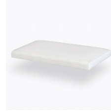
Seat Cushion is Field Replaceable

Caterina bariatric chairs are rated to 500 lbs weight capacity.