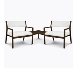
Optional Linking Tables

The seat cushion can be replaced in the field.