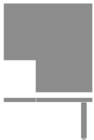
Caterina Corner Linking Table, with Leg Support Moasdfadel: CTLKTBLA 31.75W 31.75D 15H